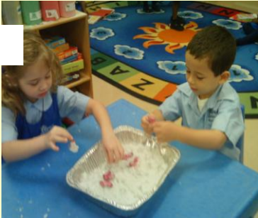
Playing in the “snow.” On right: A block replica of the Holiday Performance!